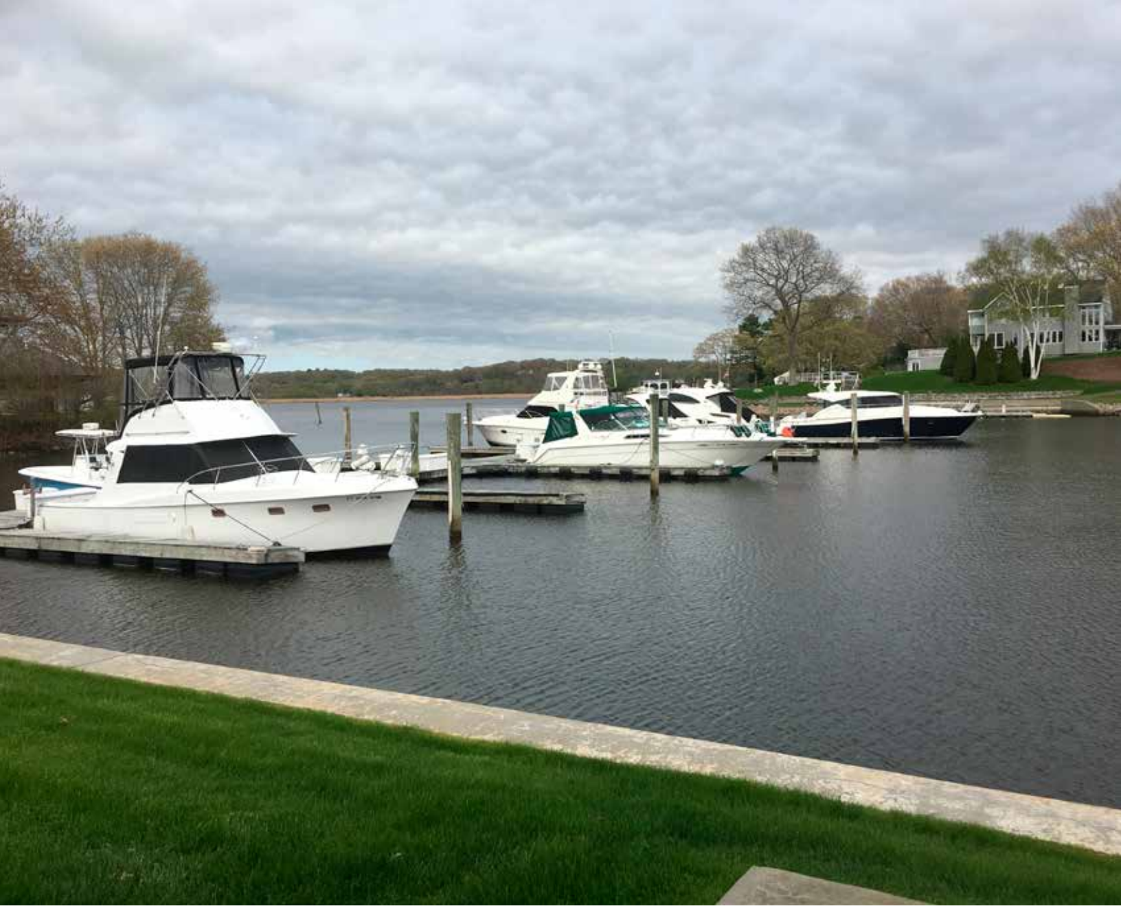
SUMMER'S COMING: Boats docked in Deep River await prepping by their owners for the season ahead.

"My grandfathers, both of them, were fishermen, so we'd always go to Scituate, Massachusetts, and go fishing," he says. "I always had a love for boats. It's never, ever stopped."