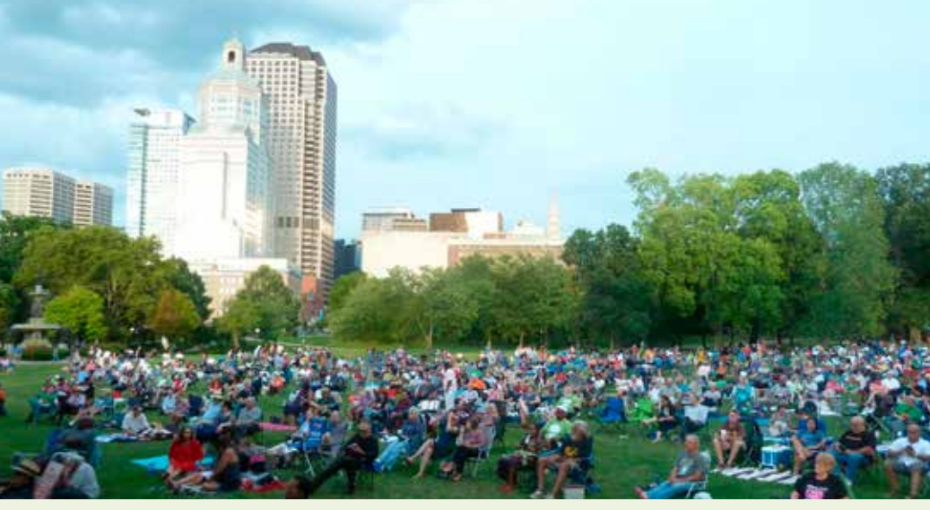
The Paul Brown Monday Night Jazz series consistently draws big crowds in downtown Hartford.

While space is limited and all seating is ticketed for performances inside the Emerson PAC, other elements of the festival – such as student concerts, artist talks and clinics, food, drink and family entertainment – will be part of a new