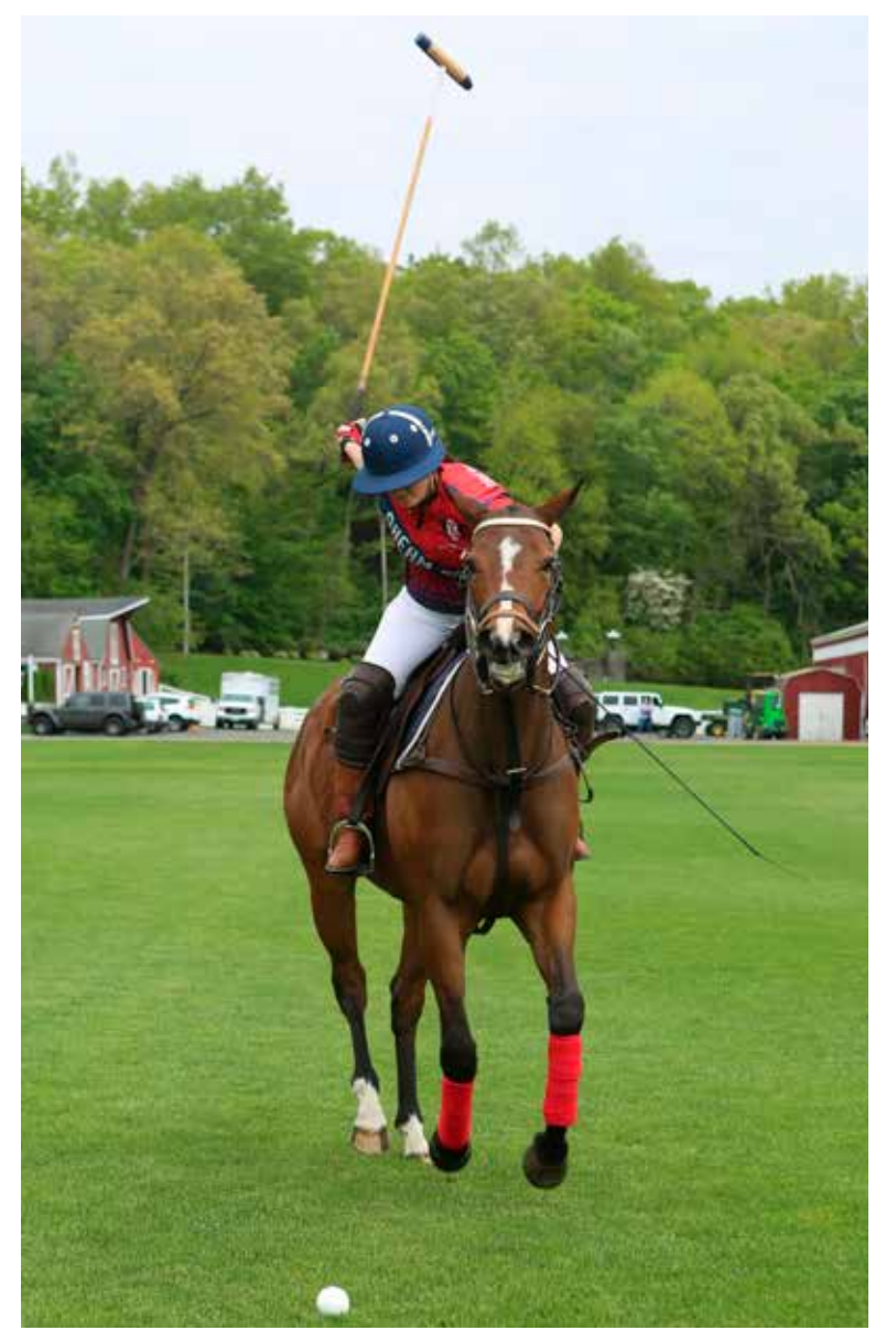
BIG PLANS: The Farmington Polo Club has set its sights on becoming a significant player in the polo world. It hosts the New England Pro-Am in August.

between chukkas to replace the divots kicked up by the horses. Try doing that at a National Football League game.