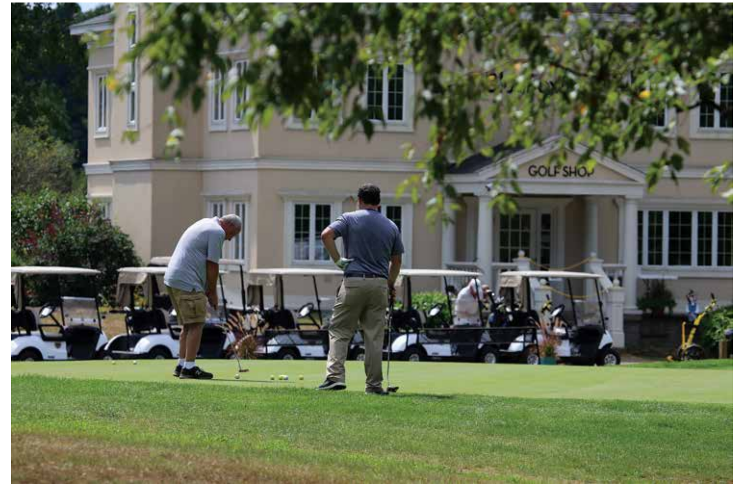
LEARNING PROPER FORM: A player enjoys enjoy a golf lesson at Blue Fox Run in Avon.

Newington • Waterford • Westport • CThumane.org