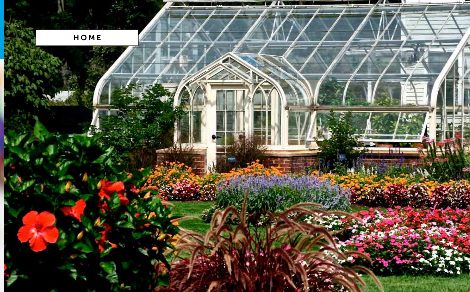
LIVING IN GLASS HOUSES: The The greenhouses at Elizabeth Park are magnificent historic structures that date from the 1890s and have no automation.