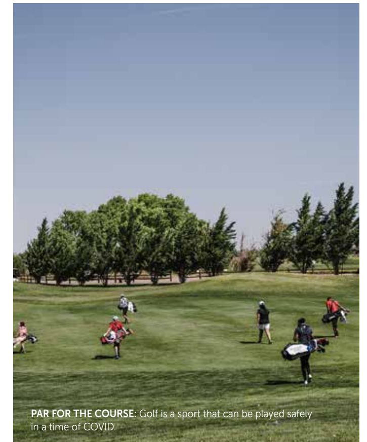
PAR FOR THE COURSE: Golf is a sport that can be played safely in a time of COVID.