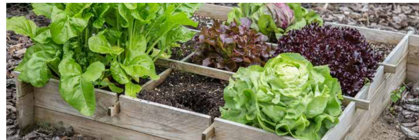
PREPPING THE PRODUCE SECTION: Since the pandemic hit close to home, many people have begun growing their own vegetables and herbs as a way to become more self-sufficient when it comes to their food supply.

Joel Samberg has landscaped his Avon home with raised beds, walkways and bordered gardens using only materials found around the property, which he says is a great option, given today's cost of living.