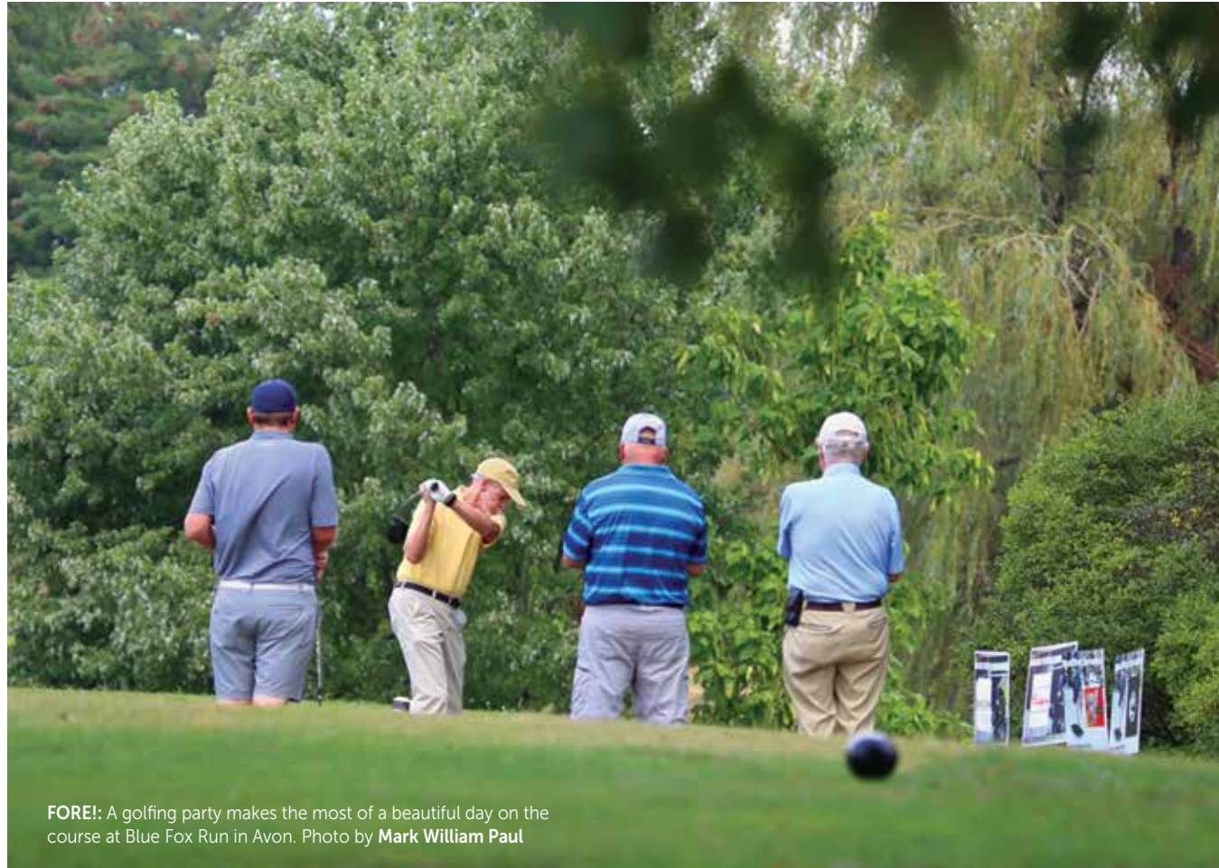
FORE! A golfing party makes the most of a beautiful day on the course at Blue Fox Run in Avon.

of first-timers, plenty of college kids. I think golf is the safest sport to play. Most people are 200 yards away when on the courses. Hopefully we can keep the new golfers.”