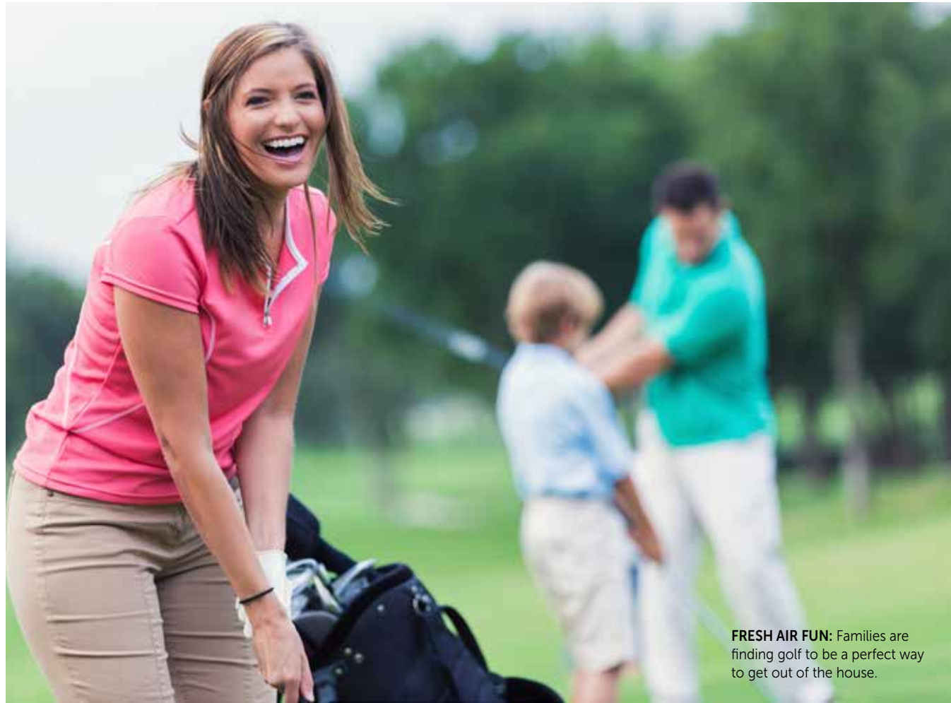
FRESH AIR FUN: Families are finding golf to be a perfect way to get out of the house.