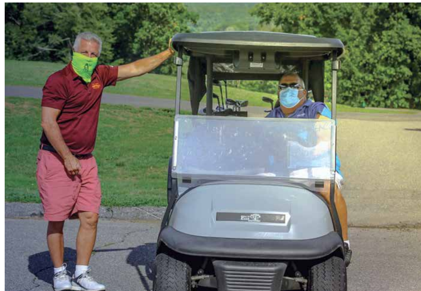
Golfers abide by the masking and other safety rules at Fairview Farm Golf Course in Harwinton.