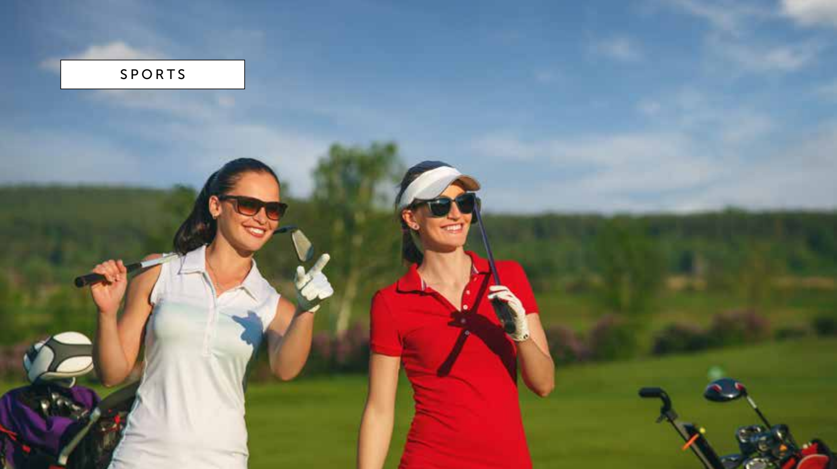
TEED UP: New England residents are having a blast on Connecticut's golf courses, enjoying the chance to get some fresh air, exercise, and a little competitive play.